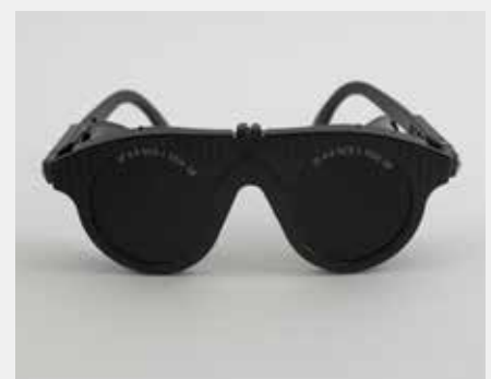
Safety glasses (88400-0499)