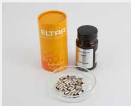
Nickel capsules (90256)