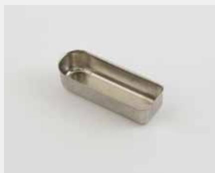
Re-usable inconel boat (88400-0502)