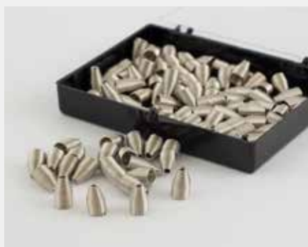
Nickel baskets (90250)