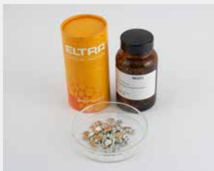
Tin pellets (90251)