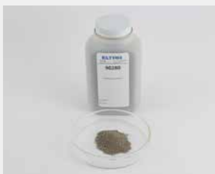
Tin accelerator (90280)