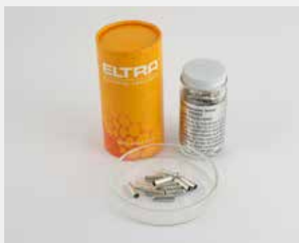
Tin capsules (90252)