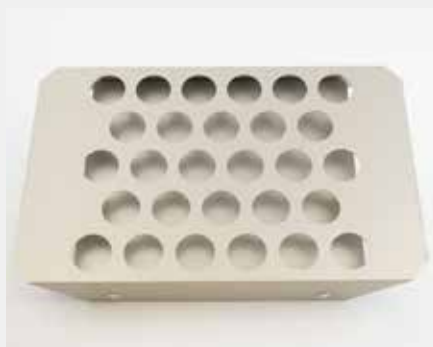
Crucible holder (88600-0015)