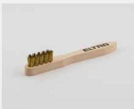
Metal brush (71031)