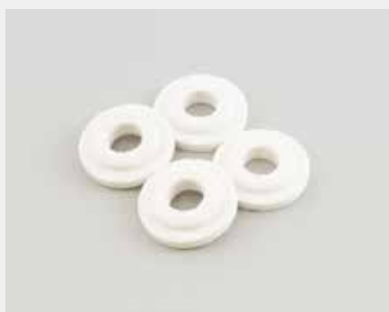
Ceramic lids (88600-0017)