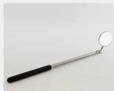
Telescope mirror (88400-0500)