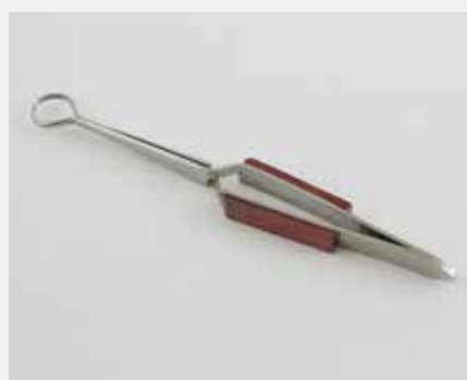
Tongs for crucibles (88400-0213)