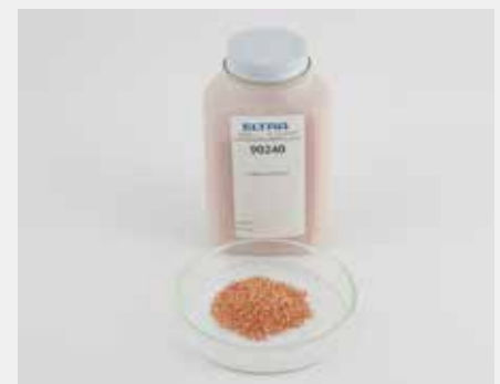
Copper accelerator (90240)